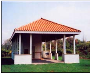
REPLICA OF ORIGINAL FATIMA CHAPEL IN PORTUGAL

For Pilgrimage Organization and more information, please contact : Office at Our Lady of Fatima Shrine (see cover for address and phone number).