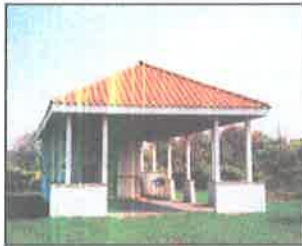
REPLICA OF ORIGINAL FATIMA CHAPEL IN PORTUGAL

For Pilgrimage Organization and more information, please contact : Office at Our Lady of Fatima Shrine (see cover for address and phone number).