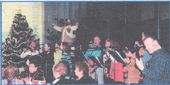
A corner of the cafeteria during the Festival of Lights.

$2.00 per person for addition of vegetable