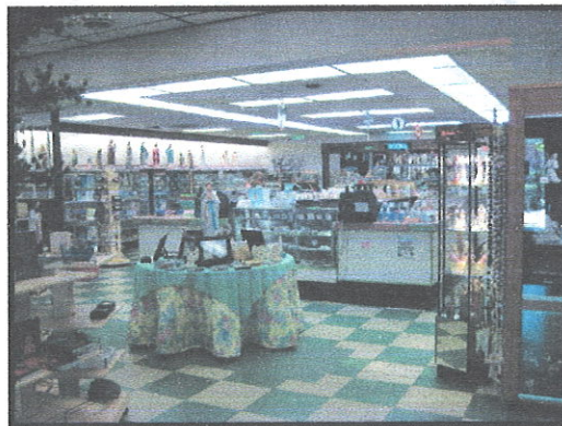
RELIGIOUS ARTICLES STORE