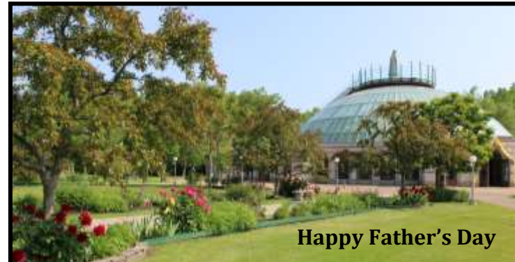
Happy Father's Day

PILGRIM CENTER HOURS Saturday - Thursday 9:00-5:00 pm Fridays 9:00-7:00 pm CAFETERIA HOURS Fridays 11-7:00 pm Sundays 10-3:00 pm & (Every First Saturday) 10-3:00 pm MASSES MON thru FRI: 11:30am & 4:00pm SATURDAY 8:00am, 11:30am & 4:00pm SUNDAY: 9:00am, 12:00pm & 5:00pm CONFESSIONS 15 minutes before every Mass EUCCHARISTIC ADORATION Wednesdays & Fridays 12 - 4pm, Blessed Sacrament Chapel FIRST SATURDAY Rosary at 11:00 & 3:30 and Adoration 12:15 ROSARY & BENEDICTION Every Sunday at 3pm Tagalog Mass @1:30 Every Fourth Sunday