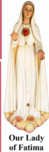
Our Lady of Fatima